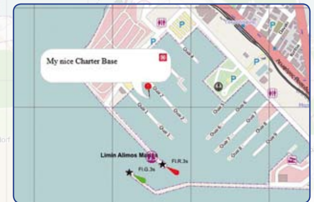
Your advertising on OpenSeaMap

http://openseamap.org/in-website-einbinden