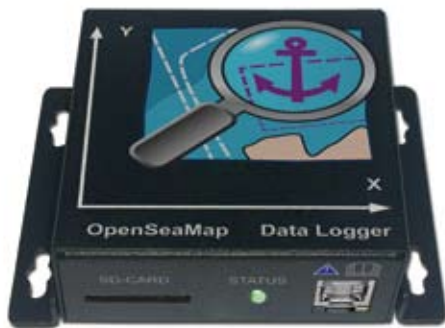
Hardware-logger from OpenSeaMap

http://depth.openseamap.org/order-logger